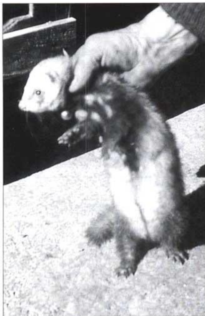
Posant-li el cascavell a la fura.